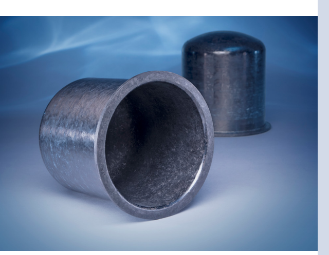
Xycomp<sup>®</sup> DLF<sup>™</sup> composite containment shell