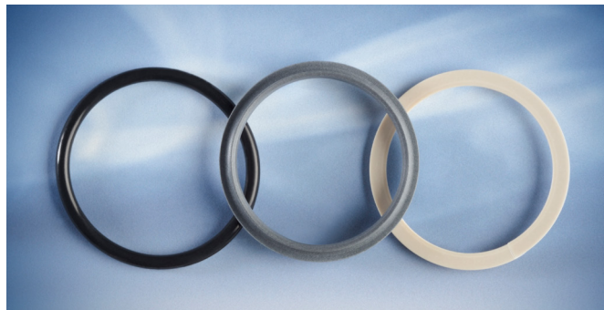
Low friction, pressure relieving, unidirectional dynamic seal for use in tandem or single rod seal arrangements

Statements and recommendations in this publication are based on our experience and knowledge of typical applications of this product and shall not constitute a guarantee of performance nor modify or alter our standard warranty applicable to such products.