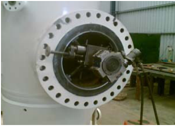
Online Filter for Train 5 Woodside LNG Plant